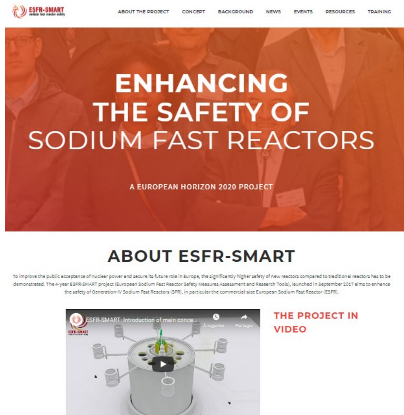
Figure 1. ESFR-SMART homepage

The ESFR-SMART video is 5'30 minutes long and directly accessible on the homepage of the official ESFR-SMART website: